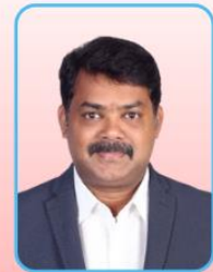
Founder & Managing Director