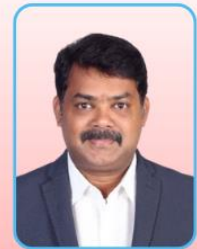
Founder & Managing Director